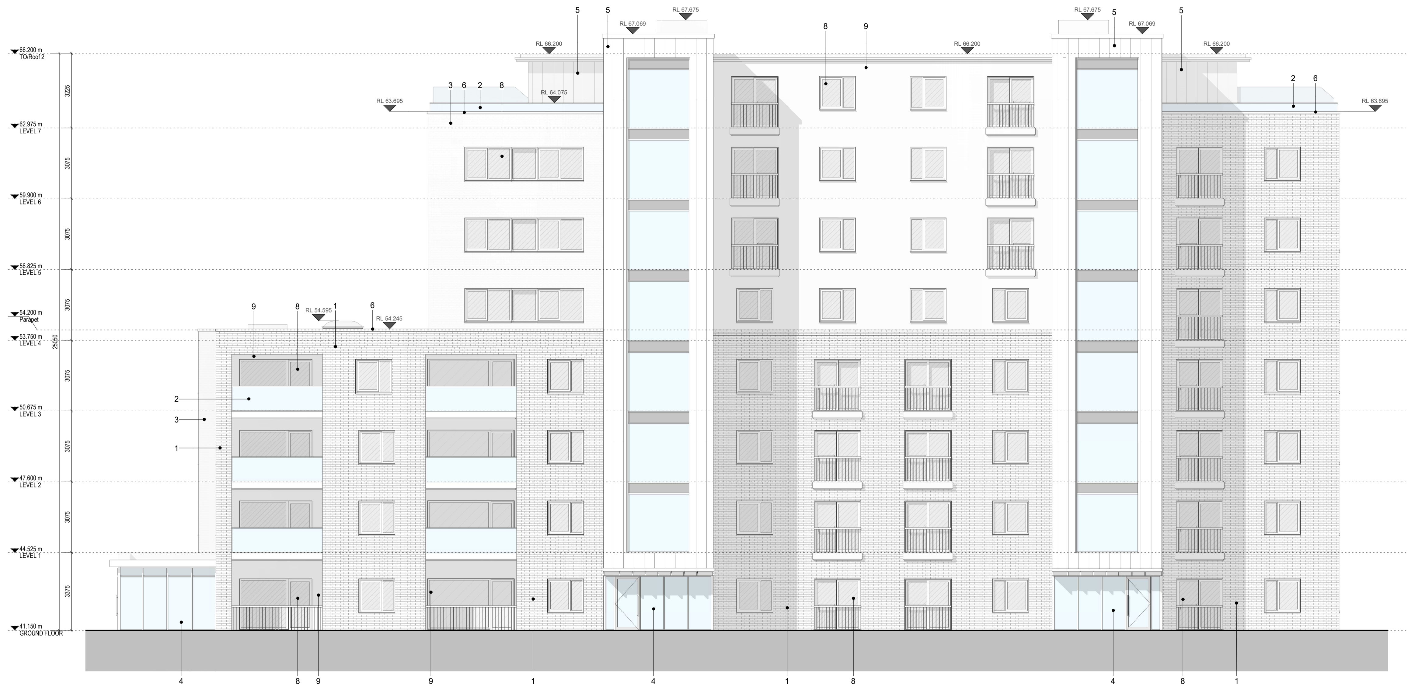
1 GA - East Elevation 1 : 100